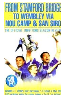
Chelsea sæson 1999-2000 FA Cup finale Chelsea-Aston Villa VHS Season 1999-2000