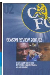
Chelsea sæson 2001-02 FA cup finale Chelsea-Arsenal VHS Season 2001-02